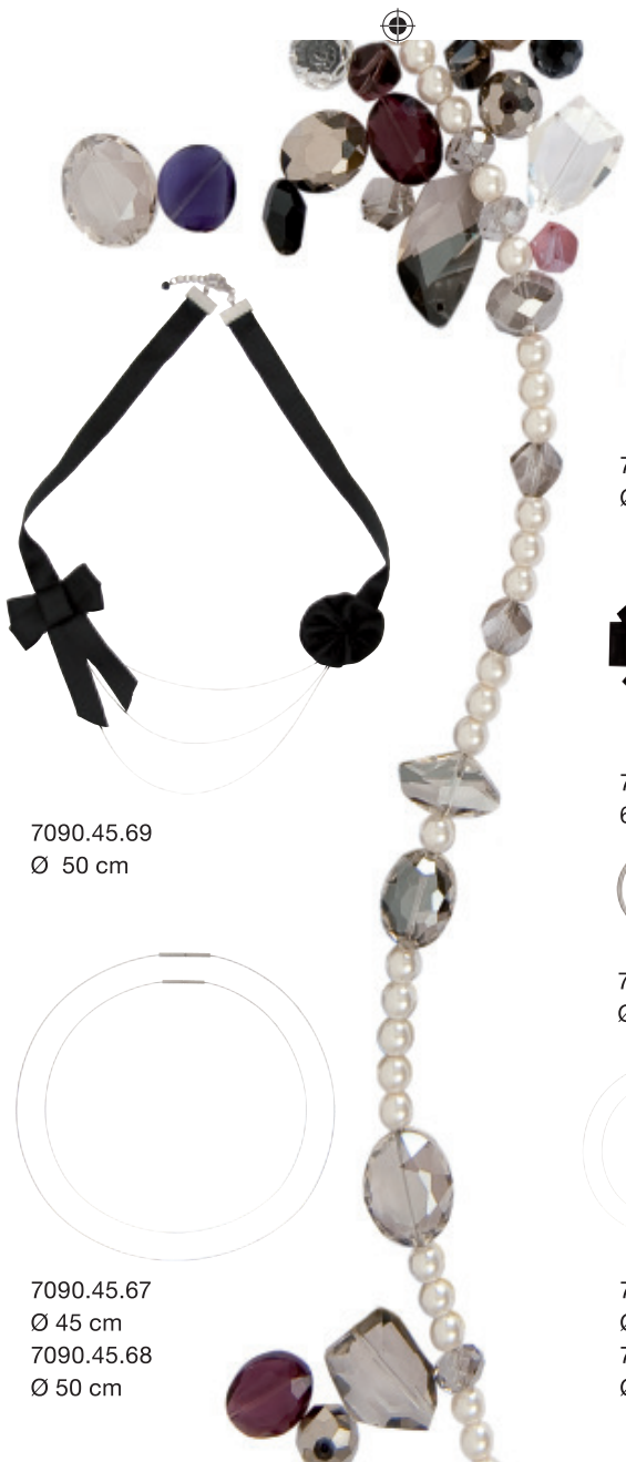
7090.45.69 Ø 50 cm